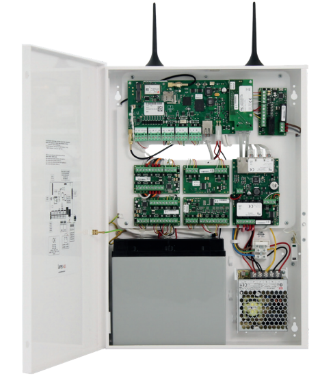
MANAGEABLE BY APP